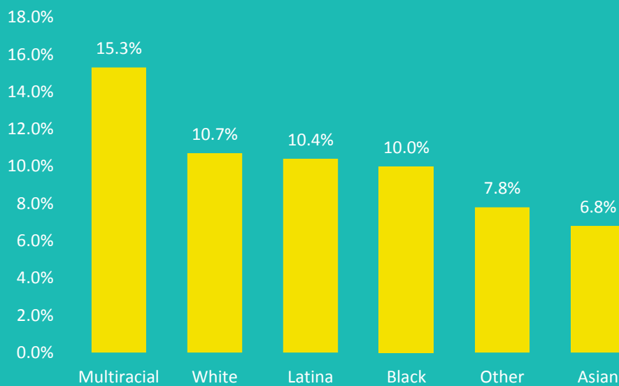
Figure 3. Percentage of girls who experienced sexual dating violence by race.

Source: NWLC Calculations from 2015 Centers for Disease Control, Youth Risk Behavior Surveillance System. 25