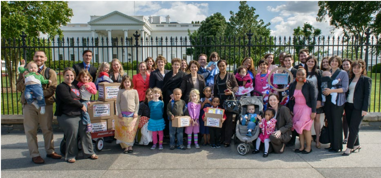
Children's artwork is delivered to the White House.