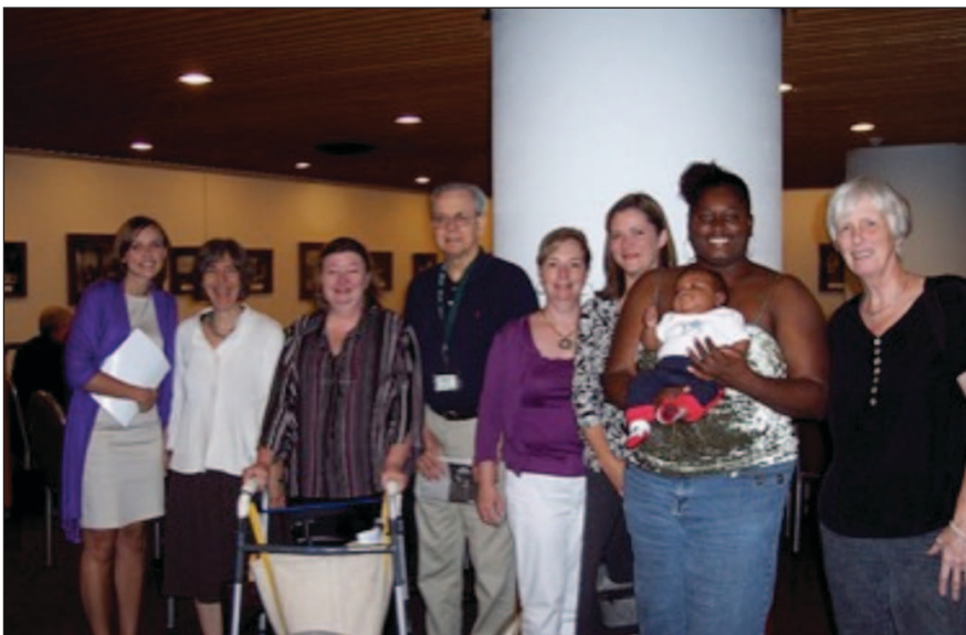
Virginia MomsRising members meet with Senate staff about the health care needs of families.

Kids of all ages benefit from health care reform, and the idea of a vote, however symbolic, to repeal it is abhorrent. The legislation passed with bipartisan support,