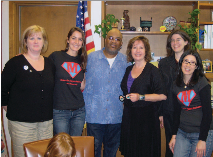
MomsRising members and coalition partners visit with California legislators.

can't return to the bad old days when insurers could drop us when we got sick or exclude our children from coverage because of pre-existing conditions.