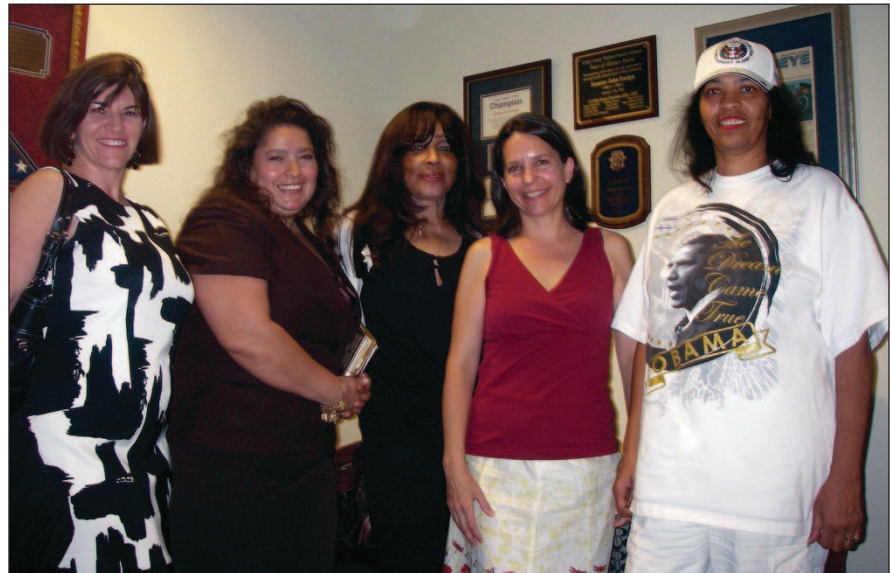
Nevada MomsRising members meet with Senate staff about the health care needs of families.

My daughter will be graduating from college in December 2011. Having taken a little longer than most to get through school, she will be 24 at that time. The last two years, we had purchased the