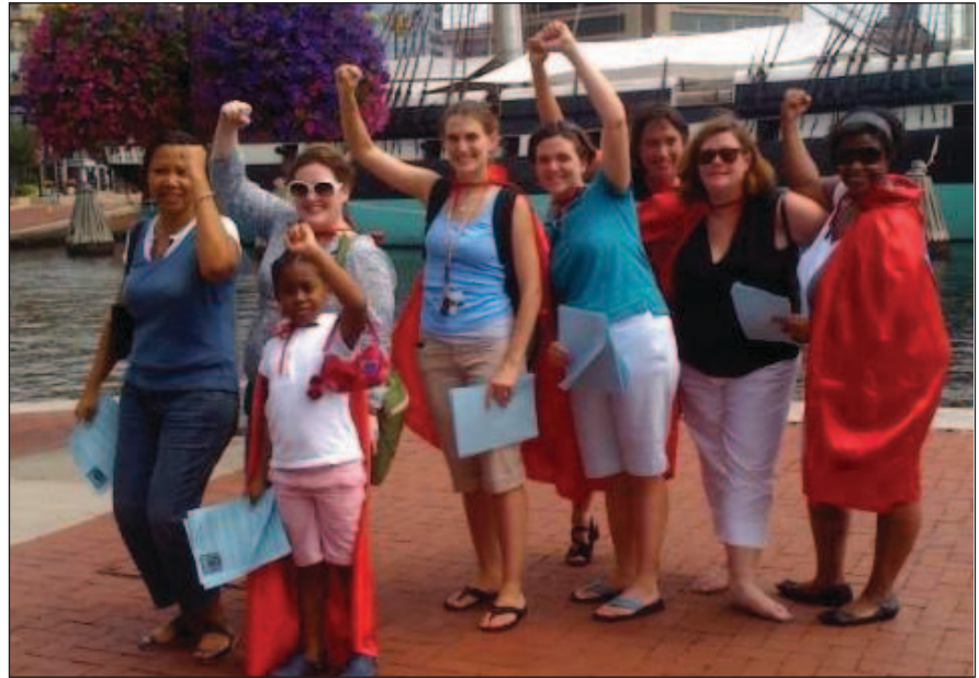
MomsRising members flex their muscles for health care reform in Baltimore.

Without the medical supplies, the insulin, and the required medical supervision from highly trained specialists both doctors and nurse educators, etc, my daughter will die. She will not die in a far off distant future, but what can be counted off as days. She will not die in a galaxy far, far away, but in the bedroom