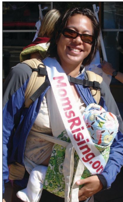
A MomsRising member marches for family economic security in Denver.