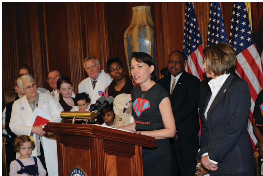
MomsRising members bring their children to the Capitol in support of the Affordable Care Act.

However, now being both unemployed and diagnosed with a chronic illness, without health care reform my new worries might have been: what if I got a new job and suddenly my income were to put me over the maximum income guidelines of the state insurance, but I couldn't get health care insurance through my new employer because I now have a pre-existing condition?