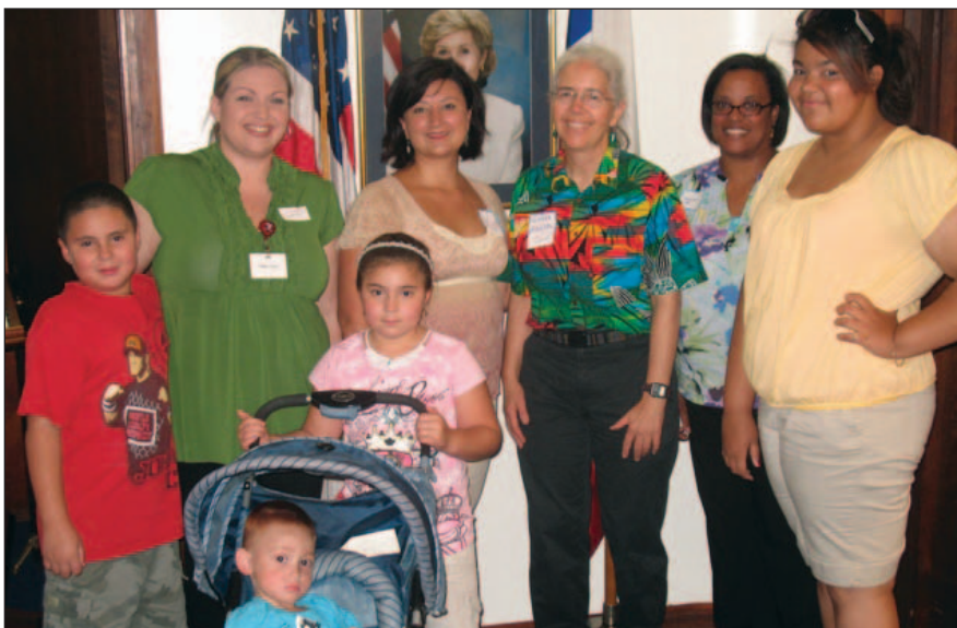
Texas MomsRising members discuss health care with Senate staff.

It also benefits employers by increasing workplace productivity as improved personal health results in less sick time absences. Families ben-