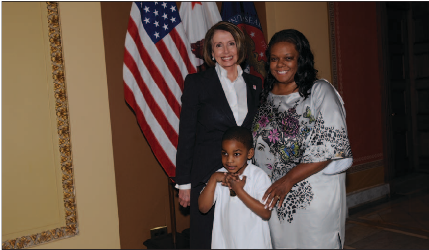
A Maryland MomsRising member meets with former Speaker Pelosi before the vote on the ACA.

employers (the engine of economic growth) who happen to find themselves in a situation like ours, 35-years-old, biological clocks ticking, COBRA benefits expiring and having to make hard choices, especially ones that don't live in a state where the government requires at least one insurance company to provide coverage to their families. How's that family friendly?